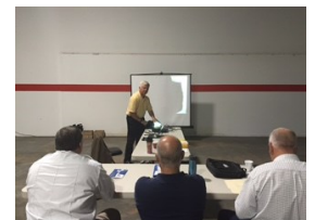
CSSO Training at GNHTD

CACT membership represents a diverse group of transportation organizations across the state, including the Connecticut Department of Transportation, public transit operators, not-for-profit transportation providers and brokerages, regional planning agencies, rideshare agencies, social service agencies, transportation providers, vendors, private for-profit providers, individuals involved in transportation and users of community transportation services. Working together, we are building a strong voice for public transportation in Connecticut.